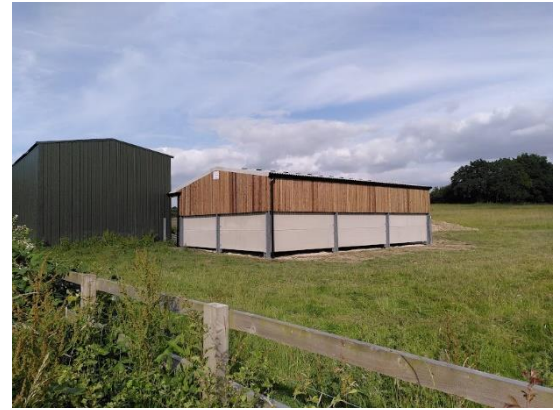
Cow shed and hay barn.